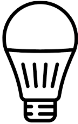
Light Bulb 3 \Omega